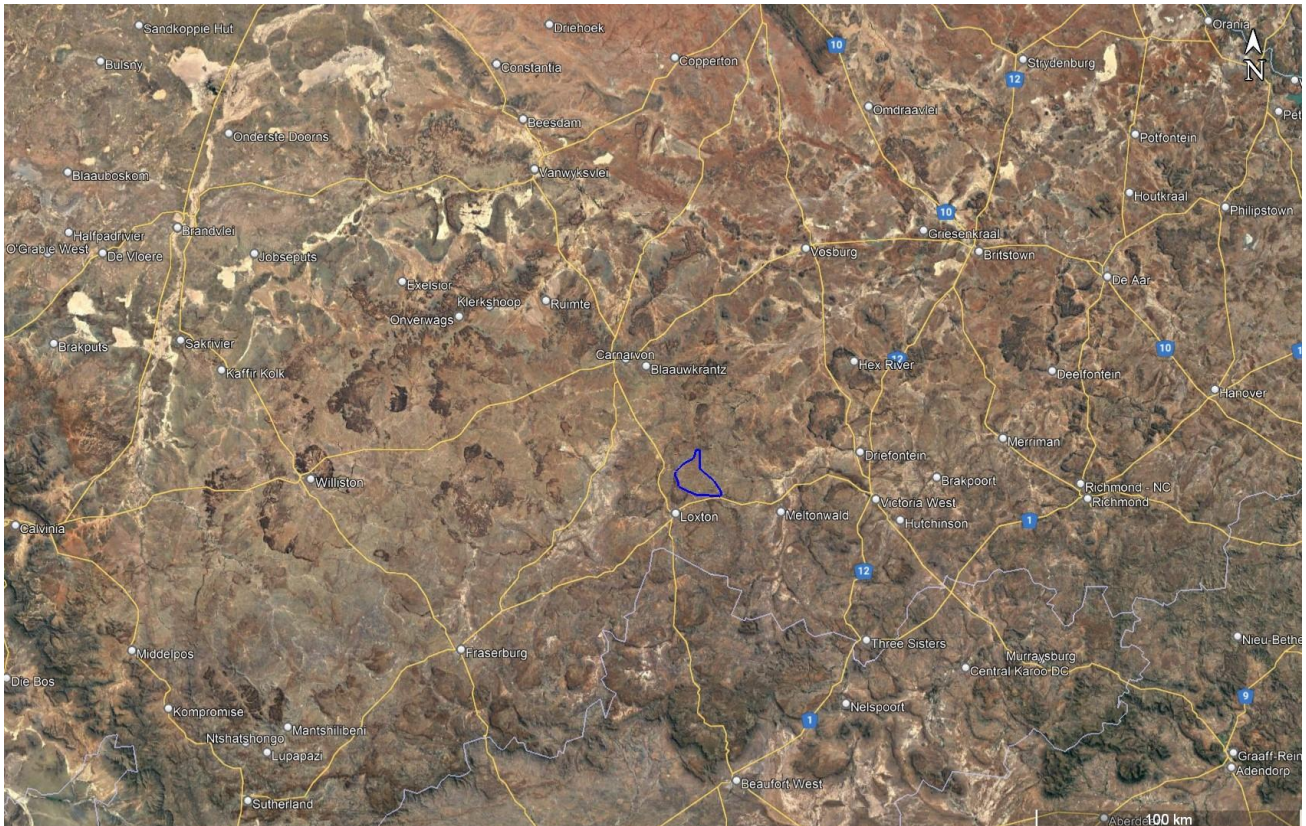
Figure 1. Locality map of the cadastral boundary of the proposed facility, north of the town of Loxton.

Environmental authorisation is being sought for the proposed construction and operation of the Loxton Wind Energy Facility 2 near Loxton in the Northern Cape Province (see location in Figure 1). In terms of the National Environmental Management Act (Act No 107 of 1998 - NEMA), an application for environmental authorisation requires an agricultural assessment. In this case, based on the verified sensitivity of the site (see Section 7), the level of agricultural assessment required is an Agricultural Compliance Statement.