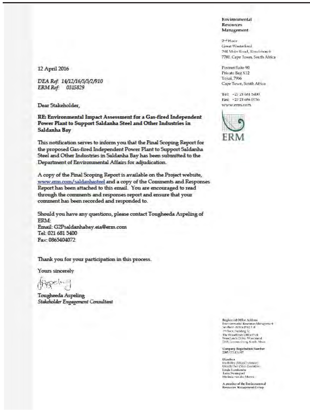
Figure 6.1 Copy of Notification Letter

Notification of the Final Scoping Report was distributed to all I&AP's in the stakeholder database on the 12 April 2016. A copy of the notification letter, as well as proof of its distributions is provided below.