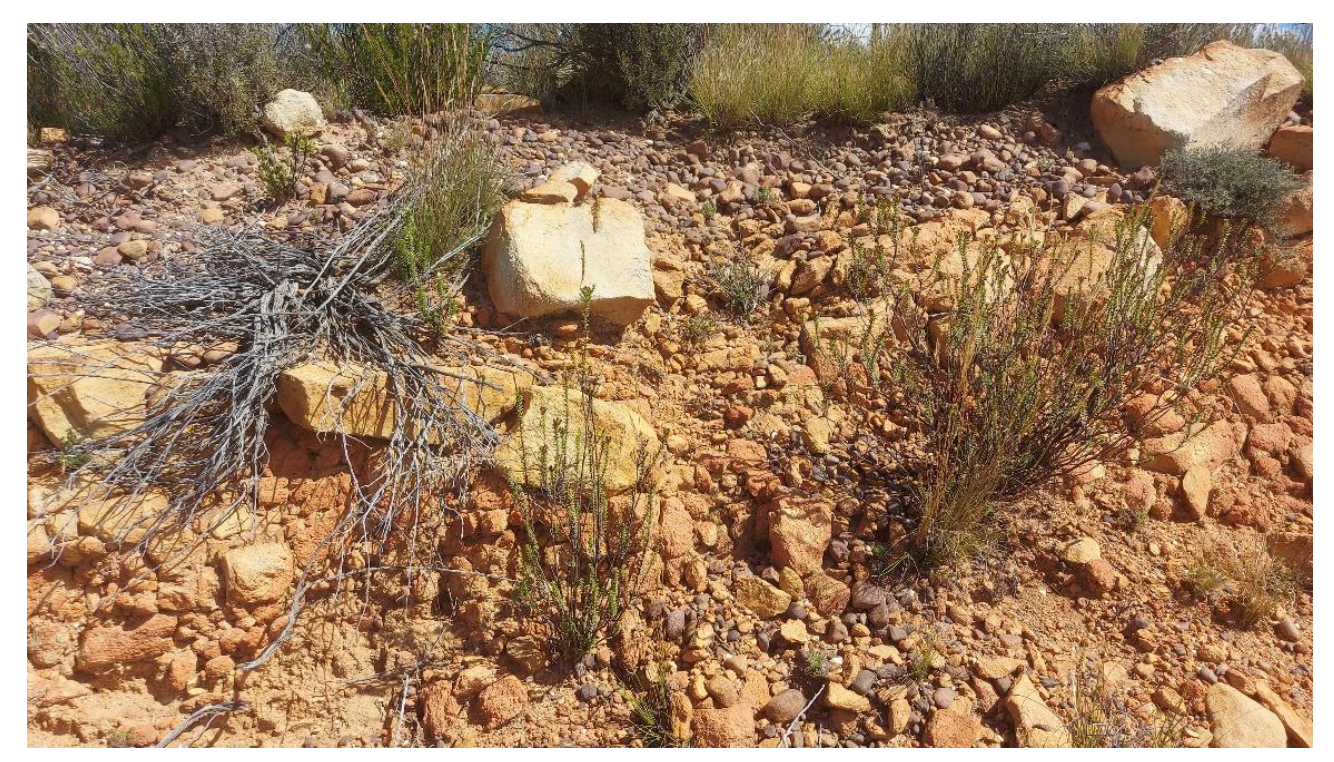
Figure 6. Profile of typical soil conditions.