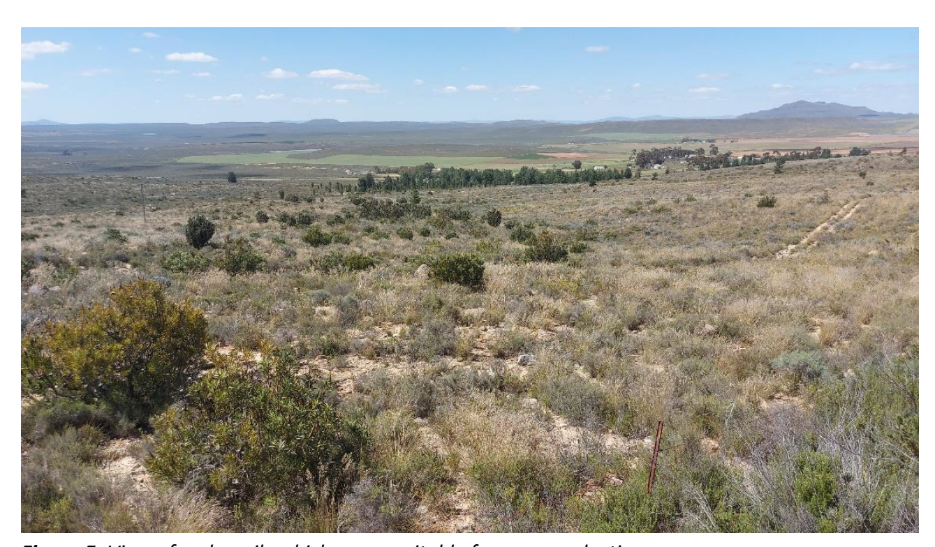
Figure 5. View of rocky soils which are unsuitable for crop production.