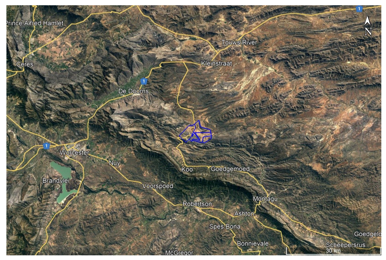
Figure 1. Locality map of the cadastral boundary of the proposed energy facility (blue outline) to the south-east of the town of De Doorns.