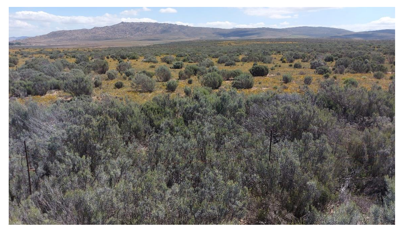
Figure 4. Typical site conditions.