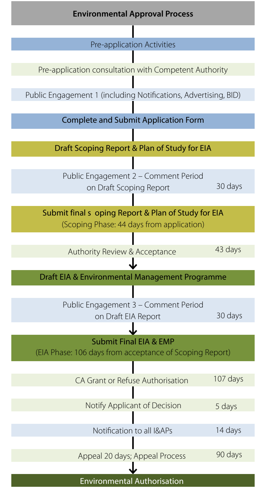
Figure 3. South African EIA Flowchart

The EIA team will make the draft EIA Report available for a thirty (30) day public comment period (3rd public engagement session). All comments, together with a response from the Project team will be included in the final EIA Report which will be submitted to the Competent Authority for adjudication. Once the Competent Authority has made a decision, all registered stakeholders will be notified of the decision.