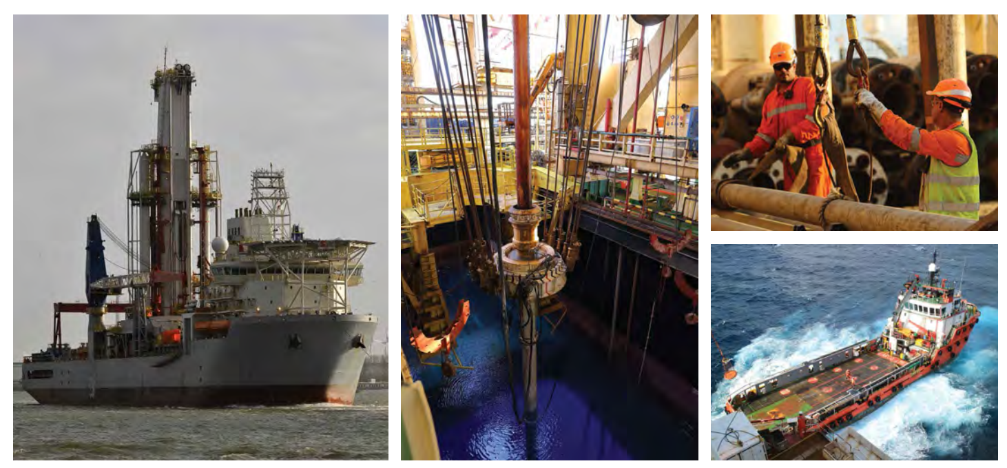
Figure 2. Example of a drillship and activities associated with the drillship

The EIA for the offshore drilling campaign is being conducted in terms of the National Environmental Management Act, 1998, (Act No. 107 of 1998).