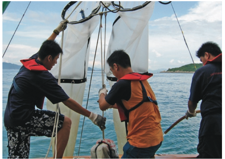
Collecting fish fry samples in Hong Kong